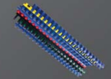
cerlox binding (plastic & metal coils)