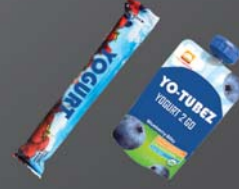
yogurt tubes & pouches