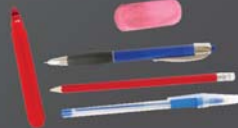
empty markers, erasers, empty pens & broken pencils