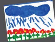
soiled paper (glitter, glue, paint)