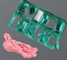
gum & gum blister packs