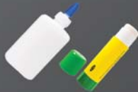
glue bottles & sticks