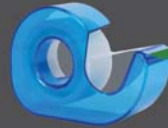
tape (scotch tape, masking tape)