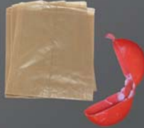
wax paper & wax wrappers